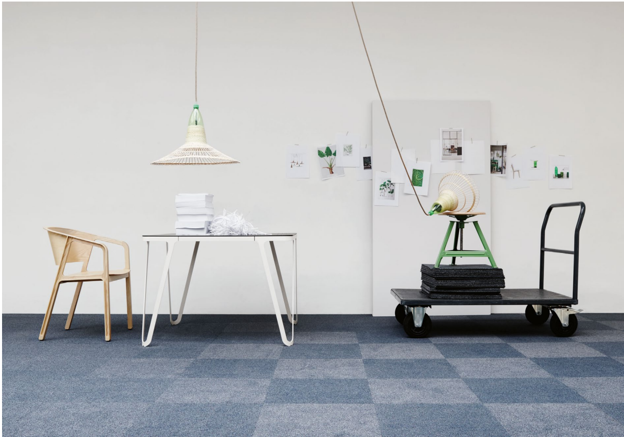
OBJECT CARPET Collection Greencard

OBJECT CARPET has received the official Material Health Statement® (MHS) from EPEA for the DUO tiles in its Greencard collection – NYLTECC, NYLLOOP and SPRINGLES ECO – launched in 2024. This not only attests to the collection's forward-looking design and consistent recyclability, but also guarantees an exceptionally high level of transparency.